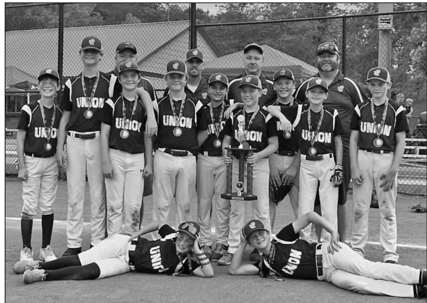
The 12U baseball team finished first at last week's MAC tournament. The 12U district begins Thursday at Madison County.

Expected GRPA State sites are Jeff Davis County for 10U and 14U baseball. Tifton hosts the 12U baseball tournament; Rockmart is the 10U softball site.